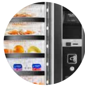
A simple design for a true automatic canteen