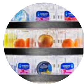
Variable temperature options