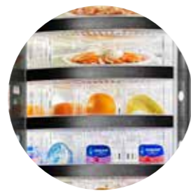
Flexible snack, food and drinks offer